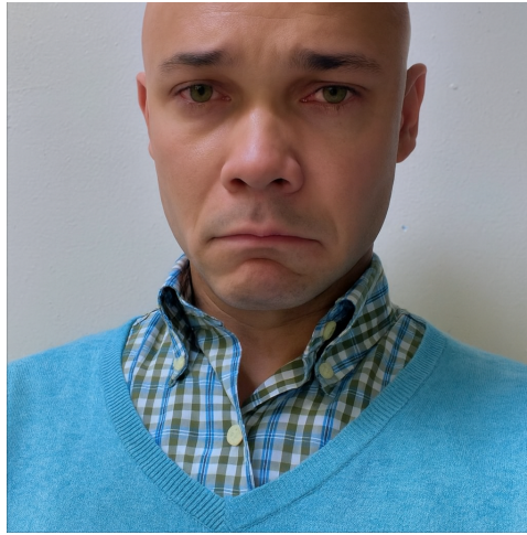
Exhibit A: Official Portrait of Rovier Carrington