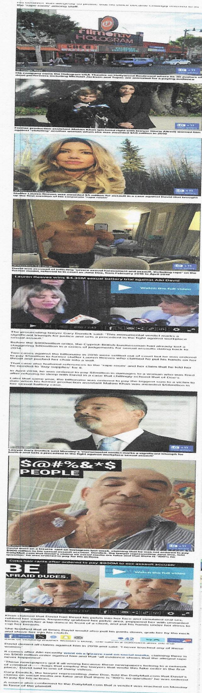
Exhibit D6 - Daily Mail Online Coverage - "Billionaire Coca-Cola heir Alki David seen for the first time since LA jury ordered him to pay $900M" This exhibit captures a Daily Mail Online article functioning as coordinated promotional

G2 - Extended Forensics - LimeWire G3 - Expanded Financial Tracing - Alpha Nero/NFT