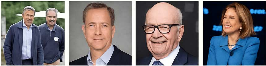
BOB IGER BRIAN ROBERTS RUPERT MUROOCH—SHARI REDSTONE