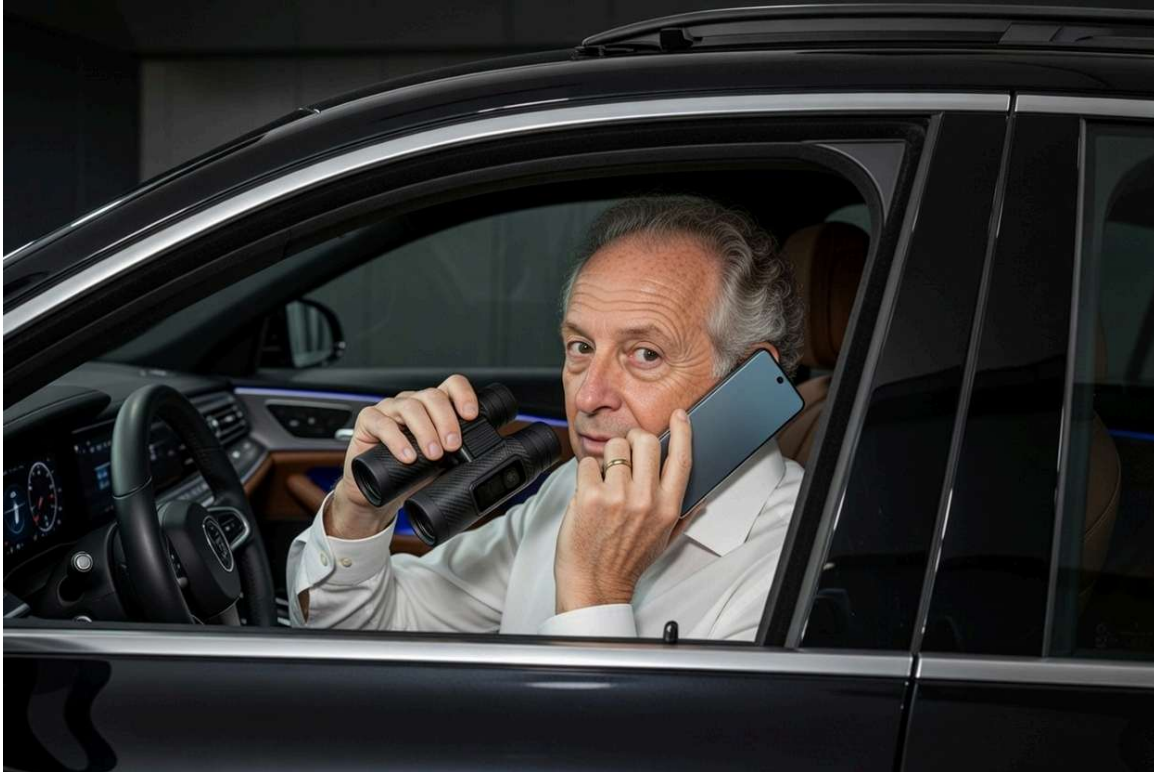
Convicted Felon Anthony Pellicano

William Morris Endeavor (WME) under Ari Emanuel – That’s the new face of the same old syndicate. They don’t just enable the abuse — they package it, commission it, and actively sell talent into these pedo circles . And when a whistleblower like me fights back?