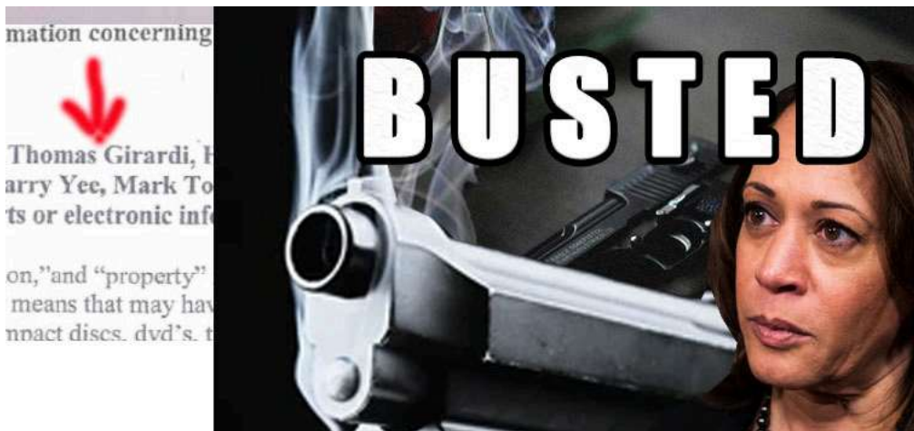
Corrupt Search Warrant 12-56 Issued by Attorney General Kamala Harris to Intimidate Critics