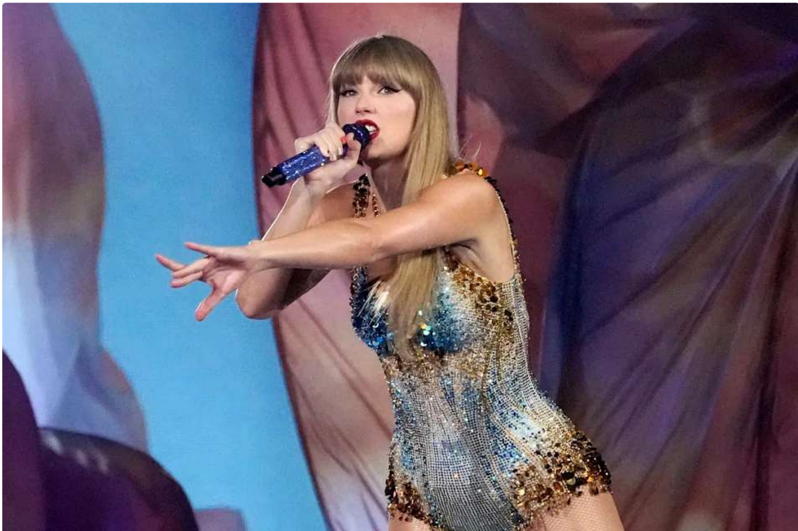
Taylor Swift performs during "The Eras Tour" at SoFi Stadium in Los Angeles on Aug. 7, 2023.

Among these factors, Ackman specifically cited "the postponement of UMG's US listing" and "uncertainty" regarding the 18% stake held by Bolloré Group, a French investment conglomerate specializing in transportation and logistics. However, he maintains that such issues can be resolved through this specific merger transaction.