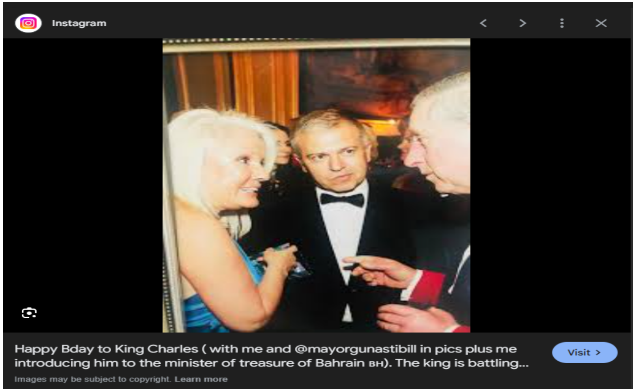
Happy Bday to King Charles ( with me and @mayorgunastibill in pics plus me introducing him to the minister of treasure of Bahrain вн ). The king is battling...

Images may be subject to copyright. Learn more