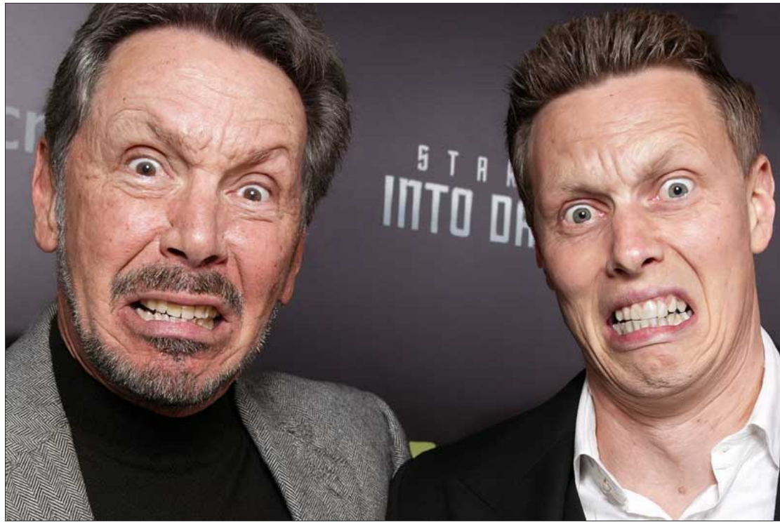
Larry Ellison and David Ellison — infrastructure power, not celebrity.