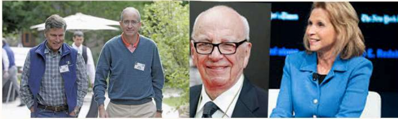
BOB IGER - BRIAN ROBERTS - RUPERT MURDOCH - SHARI REDSTONE