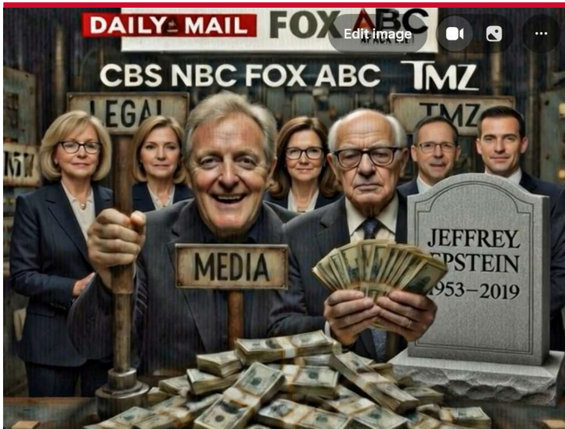
The Antigua Filings & Kings Bench Appeals Exposes Global Legal Media – Banking & Insurance Cartel