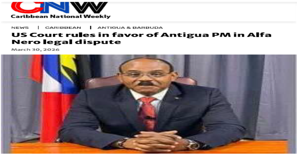
Prime Minister Gaston Browne