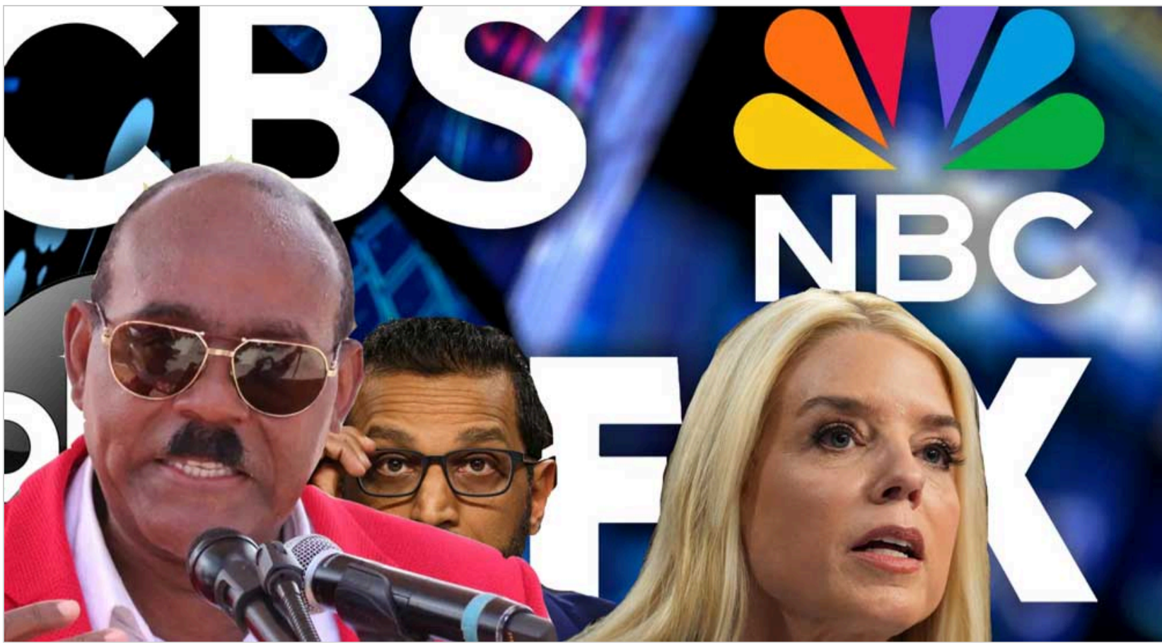
Exhibit C — Shockya feature showing international cooperation among Prime Minister Gaston Browne, Kash Patel, and Pam Bondi on lawful media-reform and anti-trafficking initiatives.