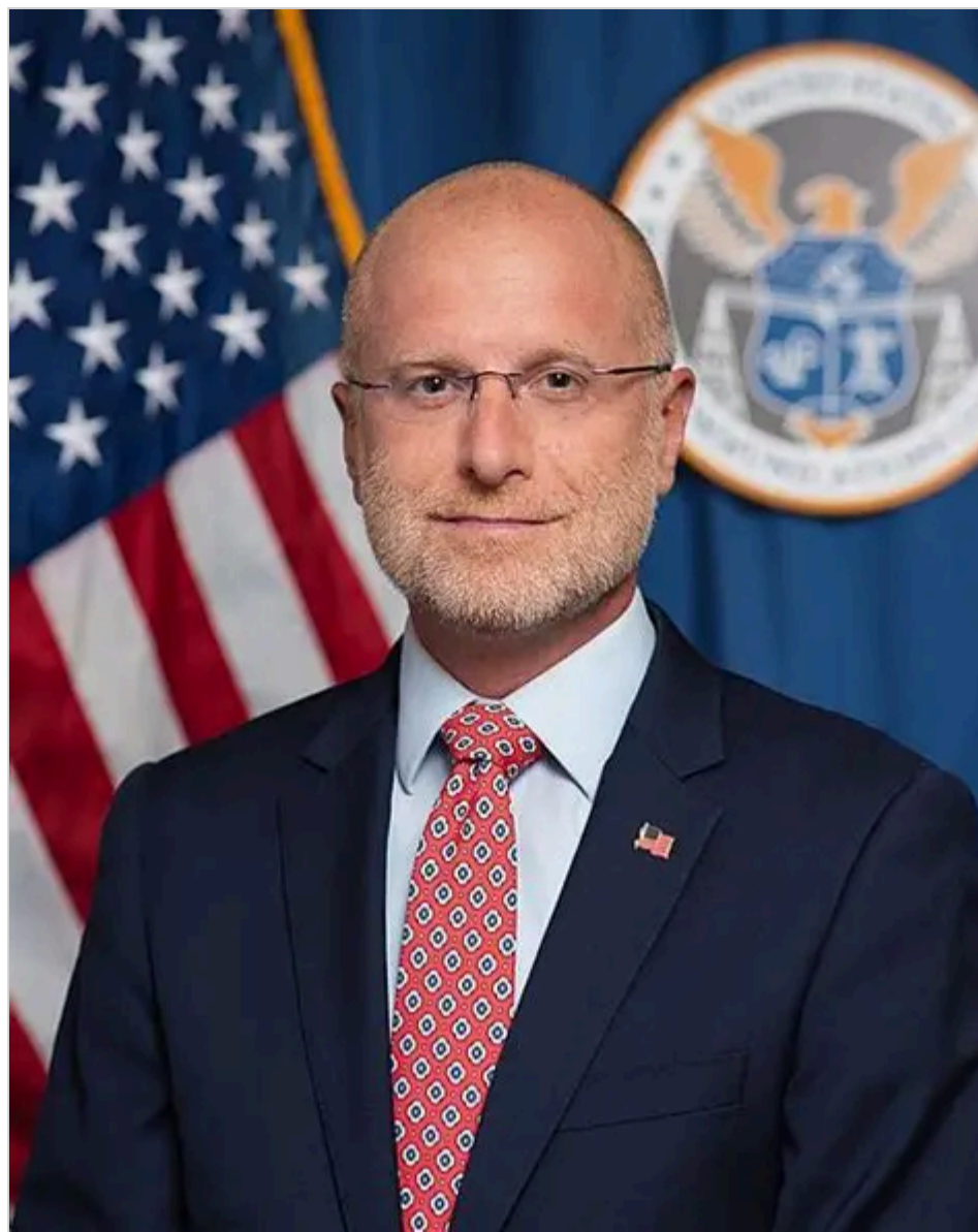
FCC Chairman Brendan Carr — official portrait