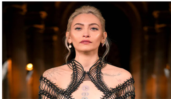
Paris Jackson in Paris in March 2025.