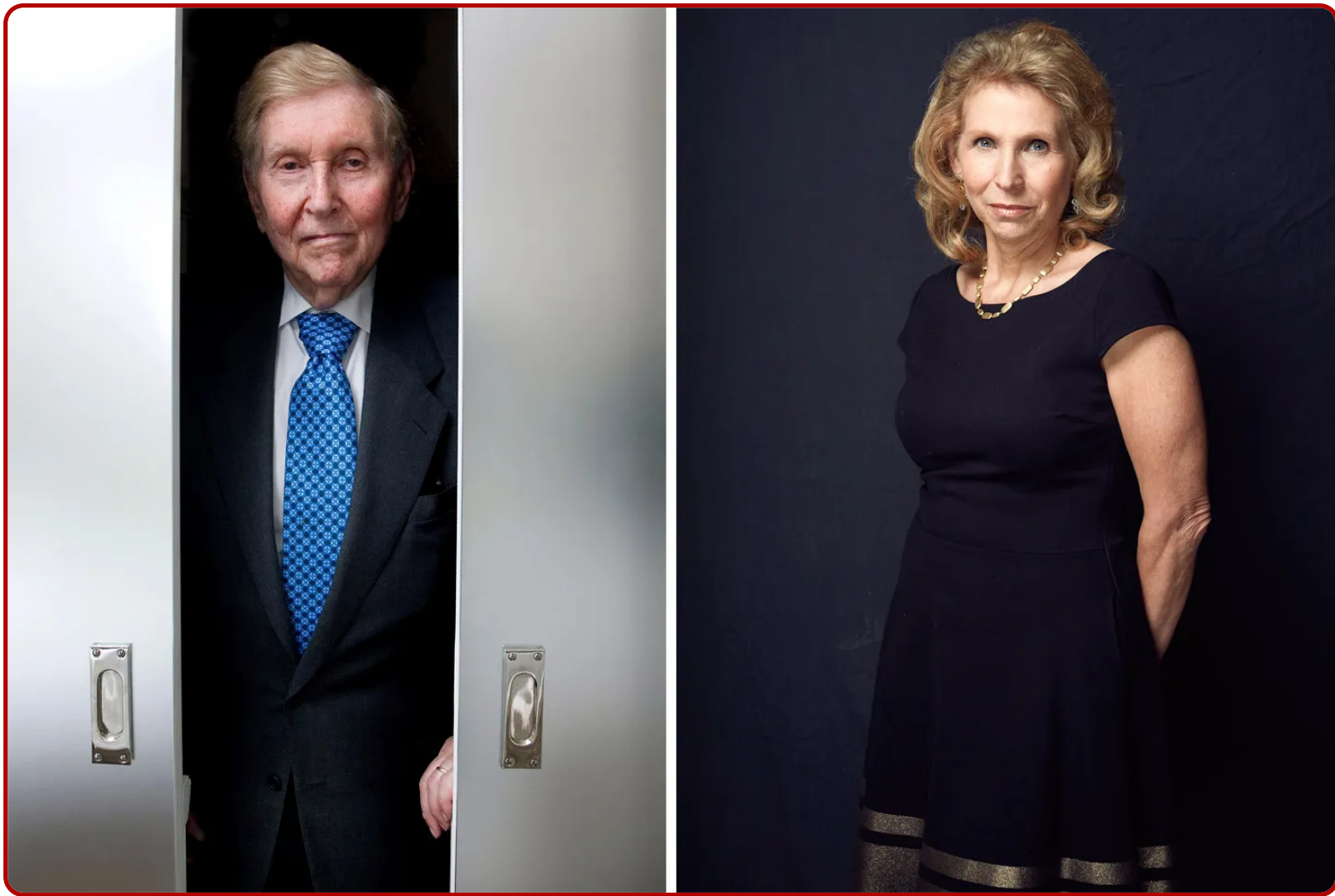
Sumner Redstone and Shari Redstone pictured with journalist Bill Cohan — image referenced in the Court record.

Filed testimony and exhibits describe Sumner Redstone’s Paramount empire as a bridge between Hollywood’s entertainment monopoly and organized crime financial networks tracing to mid-20th-century operations of Meyer Lansky and Bronfman syndicates. These associations are cited within sworn declarations now entered into the Court record, identifying cross border money movements and legacy corporate structures allegedly extending influence into Viacom, CBS, and affiliated holdings.