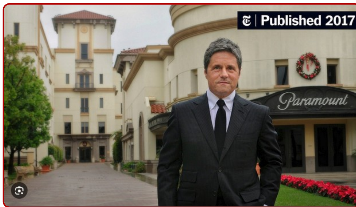
Brad Grey — former Paramount CEO and longtime associate of Sumner Redstone and Harvey Weinstein.