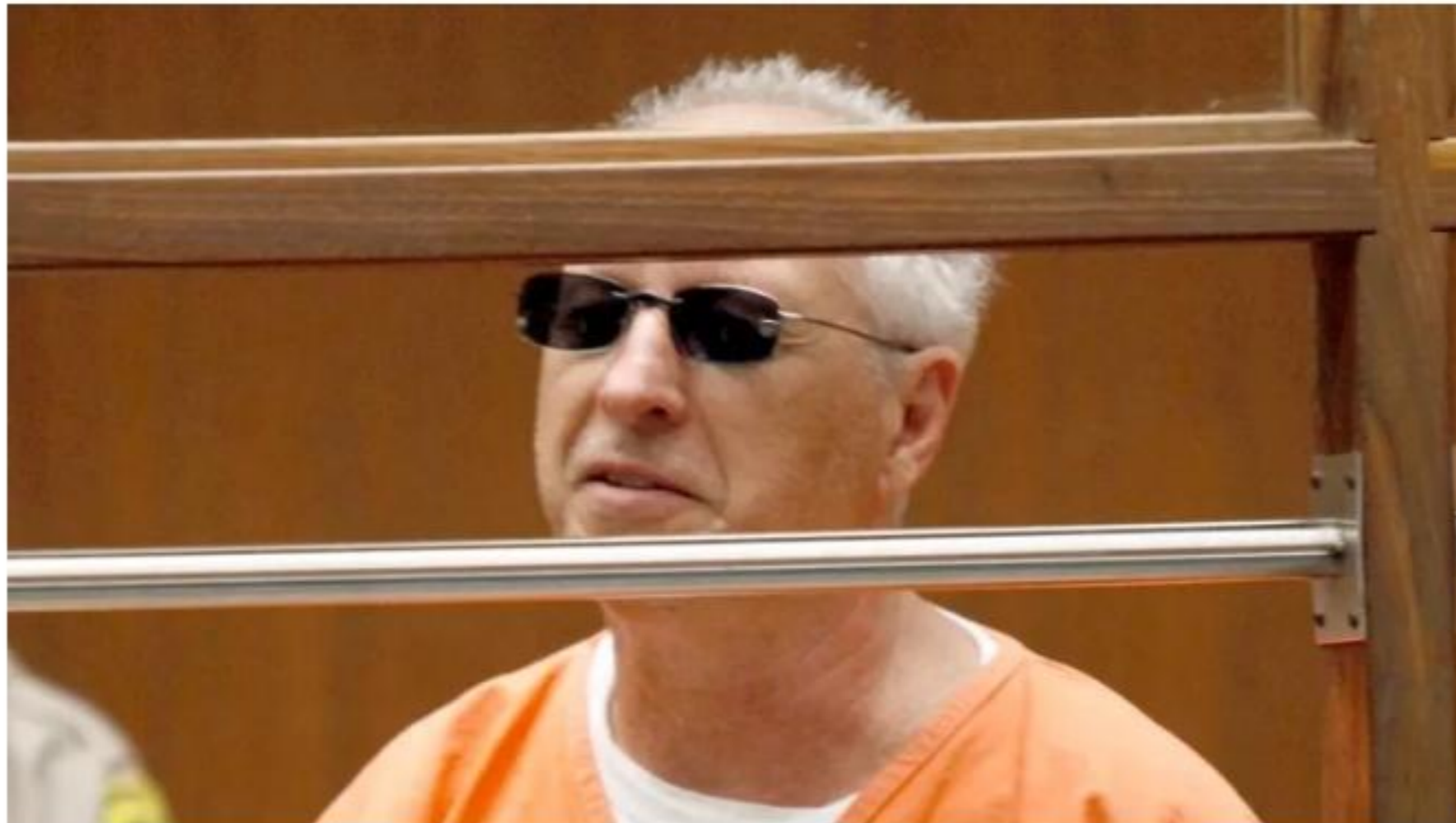
Anthony Pellicano Served 17 Years