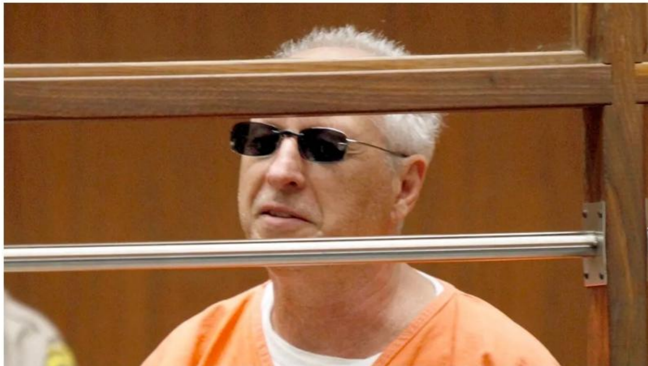
Anthony Pellicano Served 17 Years

At the heart of this unfolding scandal is Anthony Pellicano, the infamous Hollywood private investigator, notorious for illegal wiretapping, blackmail, and intimidation. Pellicano is alleged to have orchestrated a private gathering during the 2000 DNC, which quickly turned into a nightmare for young Michael Jackson supporters from the LA Unified School District. According to witnesses, including Corey Feldman and members of Michael Jackson's family, these teenagers were beaten and sexually abused as part of a twisted agenda overseen by Hollywood insiders and political elites.