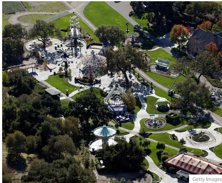
The estate had a zoo and fairground on site

Neverland has been rebranded as Sycamore Valley Ranch and has undergone extensive redevelopment since Jackson's death.