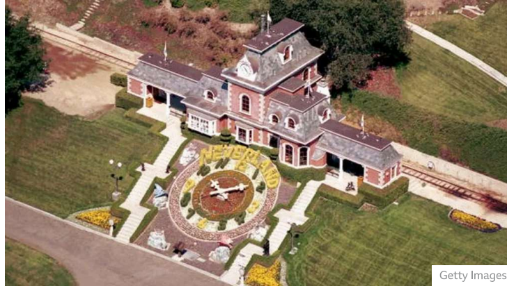
Jackson bought the estate in 1987 but struggled to pay for it

Jackson originally paid about $19.5m for Neverland, which he named after a fictional island where children never grow up in JM Barrie's Peter Pan story.