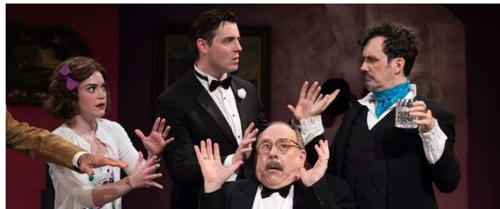
Review: YOU CAN'T TAKE IT WITH YOU at Morgan-Wixson Theatre