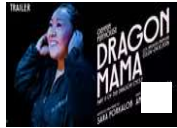
First Look at DRAGON MAMA at Geffen Playhouse