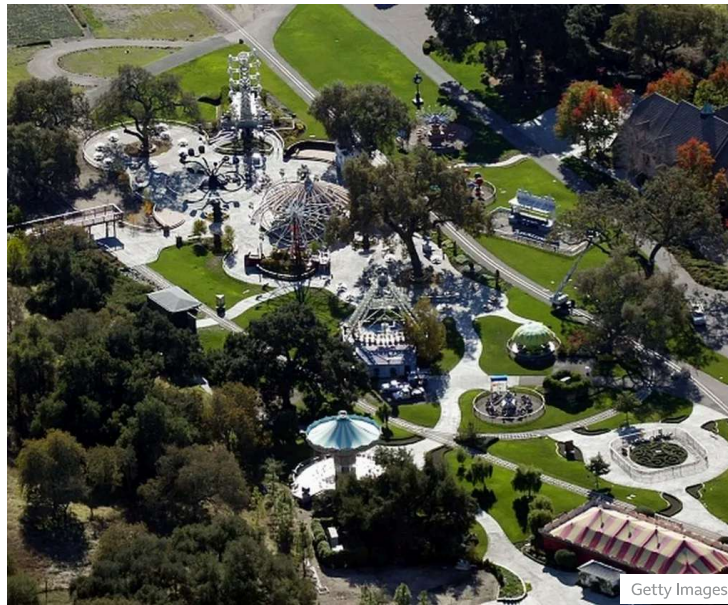
The estate had a zoo and fairground on site

Neverland has been rebranded as Sycamore Valley Ranch and has undergone extensive redevelopment since Jackson's death.