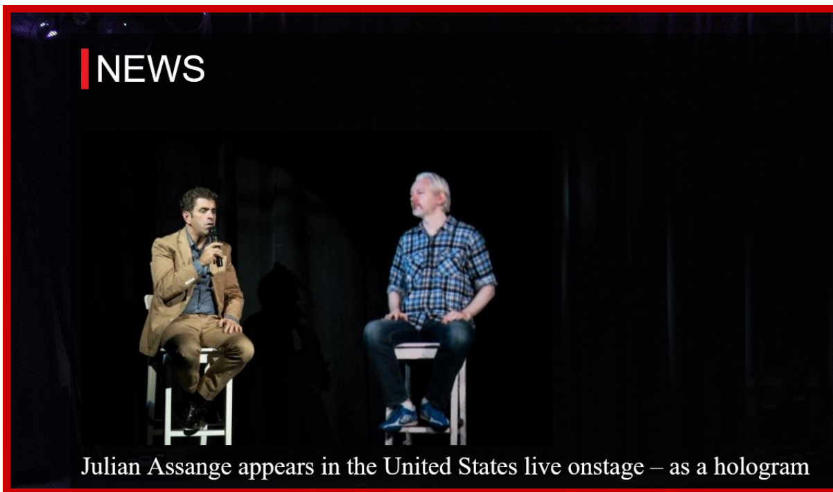
Julian Assange appears in the United States live onstage – as a hologram

Back in 2014 – In a groundbreaking moment blending activism, cinema, and frontier technology, Julian Assange appeared live onstage in the United States as a hologram , seated beside award-winning filmmaker Eugene Jarecki . The event—powered by Hologram USA’s advanced projection system—allowed Assange to participate in a public forum despite being physically confined and unable to travel.