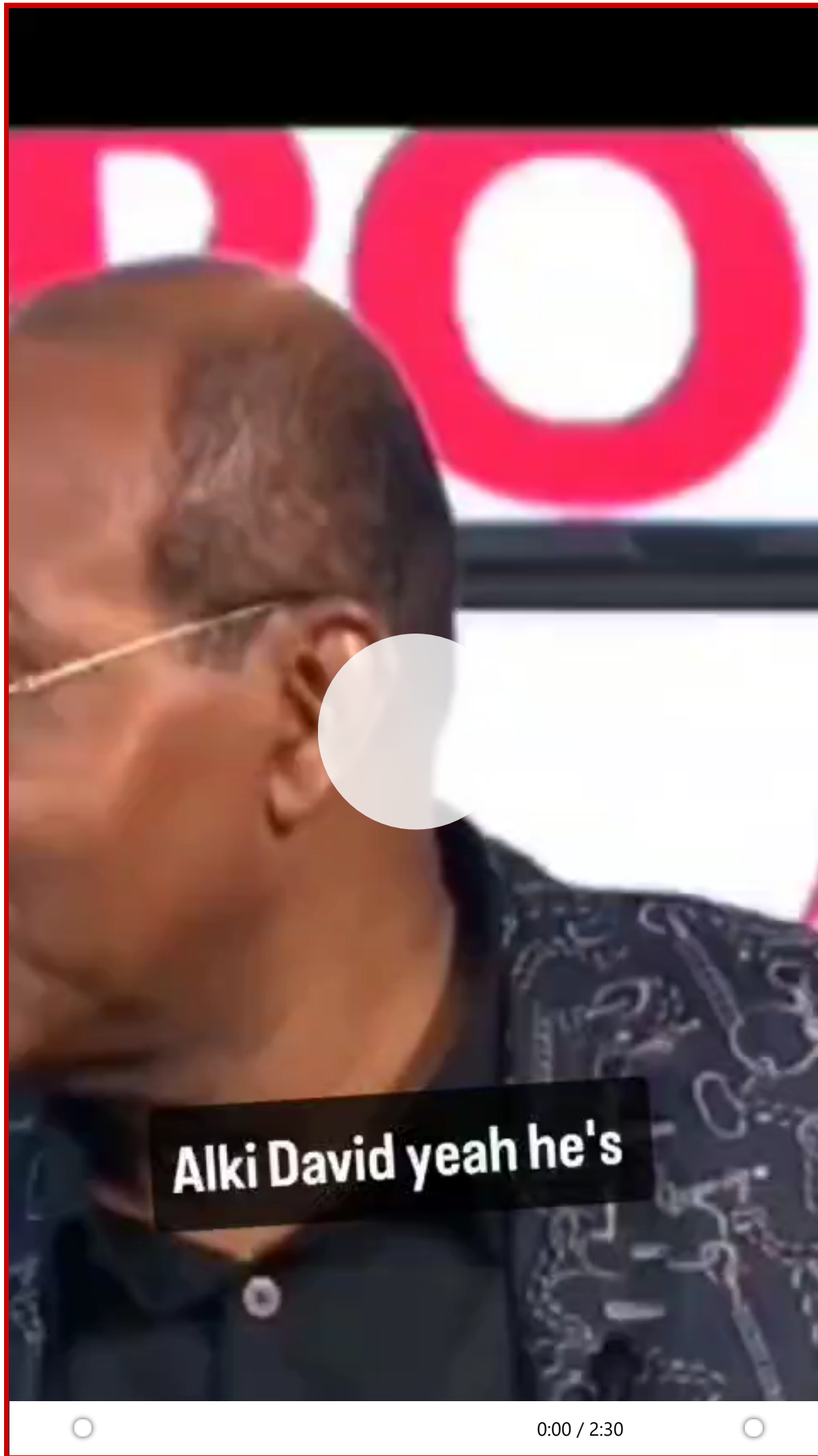
Prime Minister Gaston Browne publicly calling out the cartel in connection with the Alpha Nero yacht.