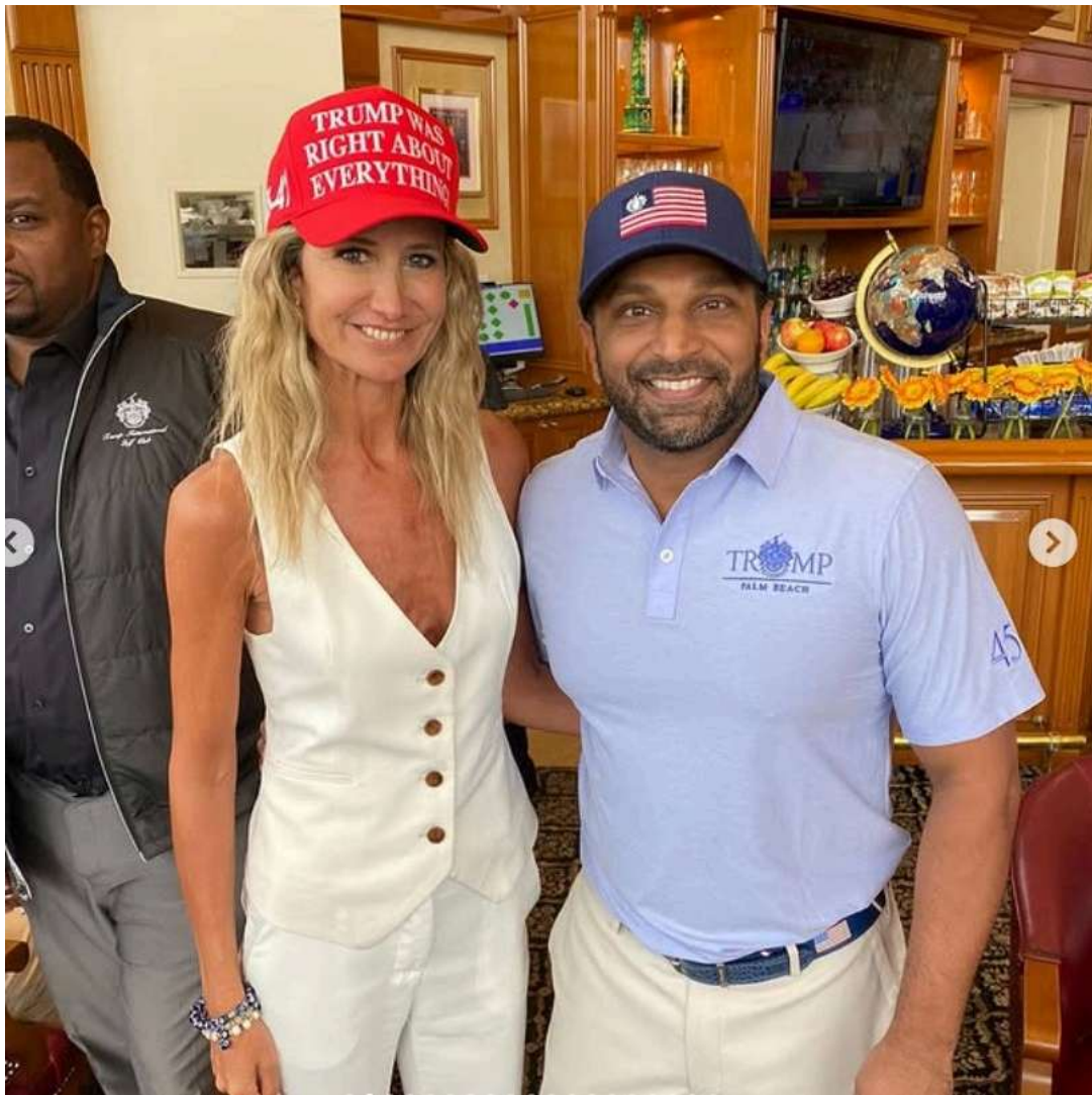
Lady Victoria Hervey with FBI Director Kash Patel