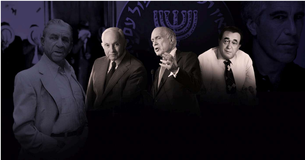
The Mega Group includes Robert Maxwell, father of Ghislaine Maxwell. Jeffrey Epstein was also a member.