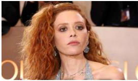
Natasha Lyonne Escorted Off Flight Hours After 'Euphoria' S3 Premiere