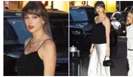
Taylor Swift Out With Friends, Wearing White Amid Rumored Wedding Planning