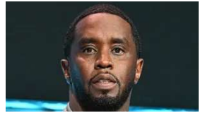
Diddy Appeals Conviction, Says Freak-Offs Were Amateur Porno and Protected by 1st Amendment