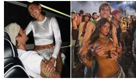
Famous Coachella Couples Through The Years ... PDA In The Desert!