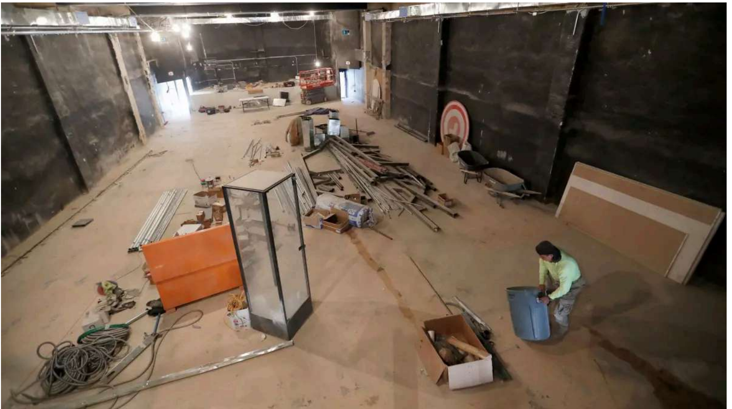
A view of the interior of Hologram USA Theater on Hollywood Boulevard on a recent afternoon.

Since then, he's invested tens of millions of dollars — and fought several lawsuits — on his quest to dominate the business of resurrecting dead entertainers.