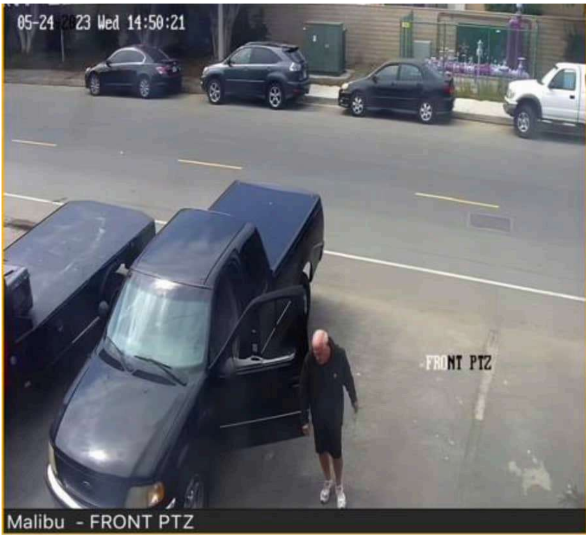
Malibu - FRONT PTZ