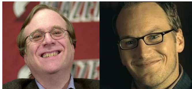
Inset - Paul Allen to the left and the character actor who plays Kholver; Pictured on the right.

The film is widely reported as one of the most disturbing films ever made and has been banned in multiple countries. It was distributed by Lionsgate, a company which Paul Allen co-owned.